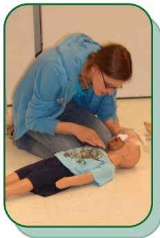
Learn rescue breathing skills