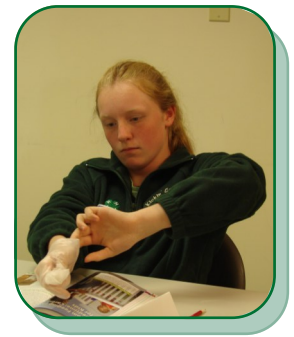
Learn basic first aid

This class usually costs $95, and is being underwritten by a grant !